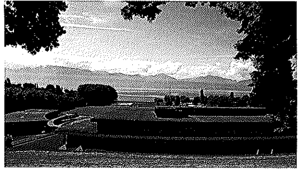
Stramatakis © Unil.